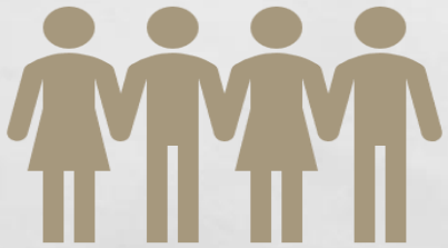
Community Engagement and Friendship Outreach