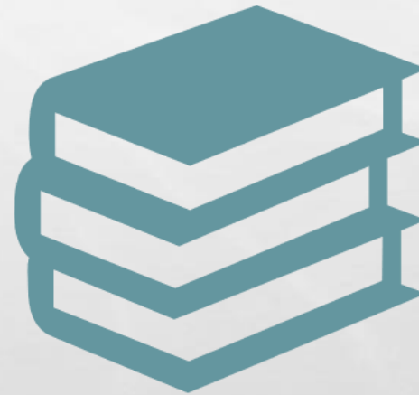
Education and Training